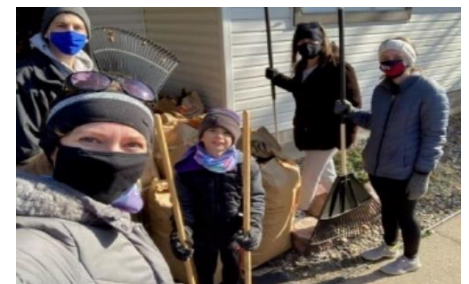
A LOOK AT LAST YEAR'S CYF FALL ACTIVITIES – TO GET YOU IN THE MOOD FOR THIS YEAR!!!